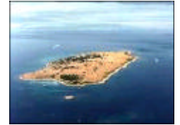
A Shared Service Centre should not be too remote from its customers!