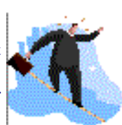
Don't try this without insurance, permission from your mother and a safety net .

Risks are all around us, but what enables individuals and organisations to operate successfully in a sea of risks is not only how sophisticated they are in identifying them, but also the strategies adopted to either mitigate, avoid or transfer risk and how to manage the residual risk. One of the first questions to ask, however, when implementing a risk