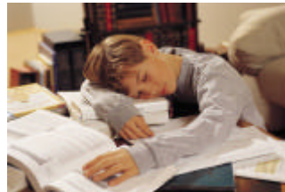
Get a good night's sleep!

What brings all these issues together is that they are all concerned with financial management and are interdependent. Too often, it is the symptoms of a financial management problem that are attacked in isolation without understanding the cause of the problem and the linkages between an organisation's processes, systems, structures and people management strategies. However, understanding the patient, carrying out an examination and making a correct diagnosis is the first step to planning and administering treatment to regain health.